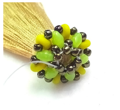
24) Between each T11/0 added in step 22) add one T11/0 and tighten.