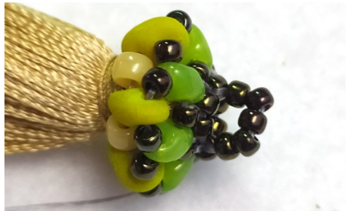
26) Pass through the loop again.