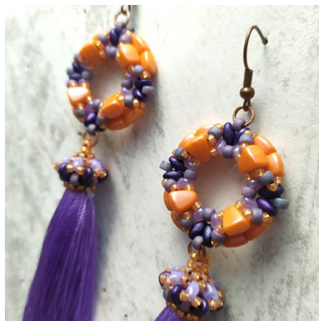
Nib-Bit: 02010/24507 Superduo: 23980/79021 Miniduo: 21310/14400 Matubo 8/0: 03000/85001 Toho 11/0: TR-11-2112