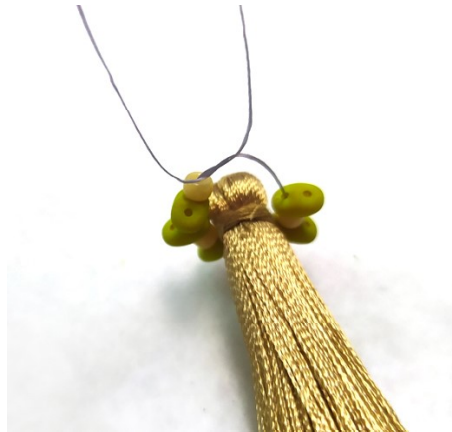
17) Tighten the beads firmly together around the tassel.