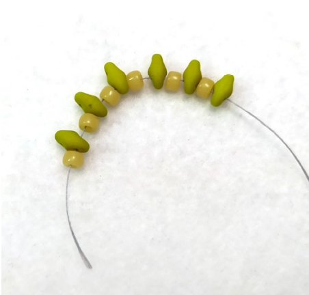
16) Tassel: string 1x M8/0 and 1x SD. Repeat five times.