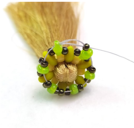
22) Add 1x T11/0 between each MD. Go through the first added T11/0 again.