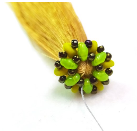
23) Tighten the beads to closing the top of the tassel.