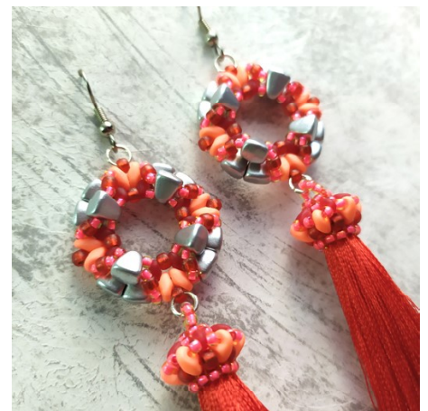
Nib-Bit: 00030/01700 Superduo: 02010/29577 Miniduo: 91250/84110 Matubo 8/0: 90080/85106 Toho 11/0: TR-11-979