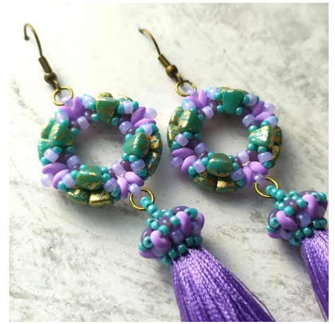
Nib-Bit: 63130/94401 Superduo: 02010/92945 Miniduo: 21010 Matubo 8/0: 21310 Toho 11/0: TR-11-413