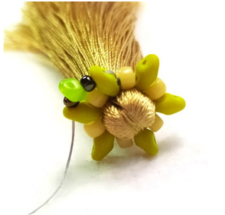
20) String 1x T11/0, 1x MD and 1x T11/0 and go through the upper free hole of the next SD.