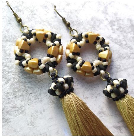
Nib-Bit: 02010/24506 Superduo: 02010/29531 Miniduo: 03000/14413 Matubo 8/0: 03000/14413 Toho 11/0: TR-11-49F