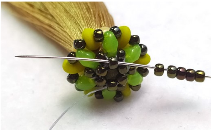
25) String 5x T11/0 and go through T11/0 on the opposite side of the circle and create a loop.