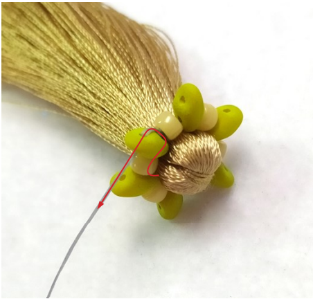
19) Go through M8/0 and SD and pass through the upper free hole of the same SD.