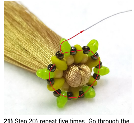
21) Step 20) repeat five times. Go through the first added MD and pass through the upper free hole of the next SD.