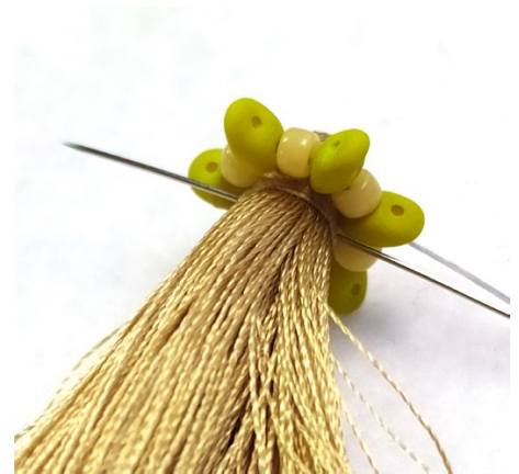
18) Stitch several times through the tassel. This will fix the position of the beads.