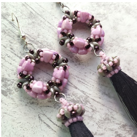
Nib-Bit: 03000/14494 Superduo: 03000/14449 Miniduo: 23980/81002 Matubo 8/0: 23980/15726 Toho 11/0: TR-11-145F