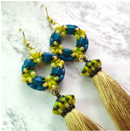
Nib-Bit: 02010/24514 Superduo: 02010/29535 Miniduo: 51010 Matubo 8/0: 13020 Toho 11/0: TR-11-83