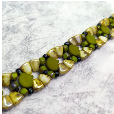
Nib-Bit: 03000/43500 Ginko: 02010/29535 3CUT 6/0: 53410/43500 Matubo 8/0: 23980/14400 Toho 11/0: TR-11-49F