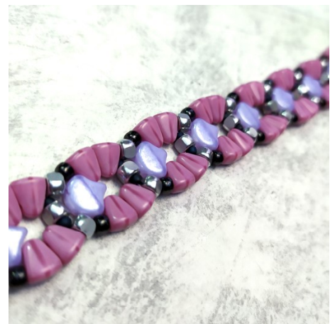
Nib-Bit: 74020 Ginko: 21310 3CUT 6/0: 00030/27000 Matubo 8/0: 23980/14400 Toho 11/0: TR-11-49F