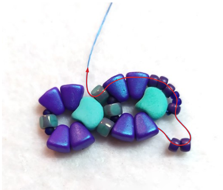
10) Add 2x M8/0 and pass through the beads, as shown.