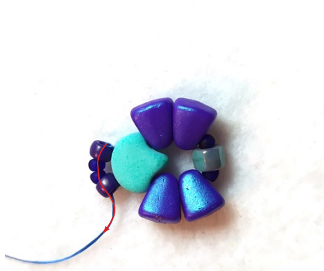
5) Go through 1x M8/0, 2x T11/0 and 1x M8/0.