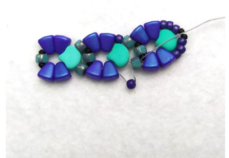
15) Add M8/0 and go through the next 3CUT.