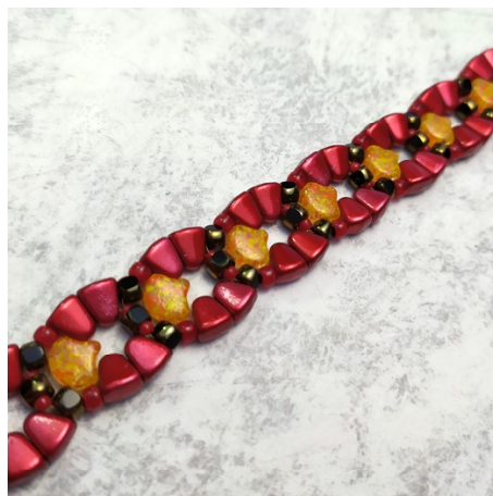
Nib-Bit: 23980/24209 Ginko: 00030/24402 3CUT 6/0: 23980/90215 Matubo 8/0: 91250 Toho 11/0: TR-11-45