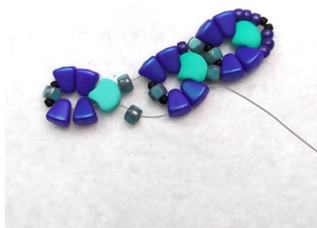
14) Repeat step 9).