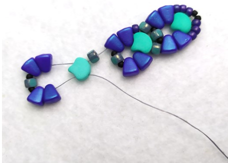
13) Repeat step 8).