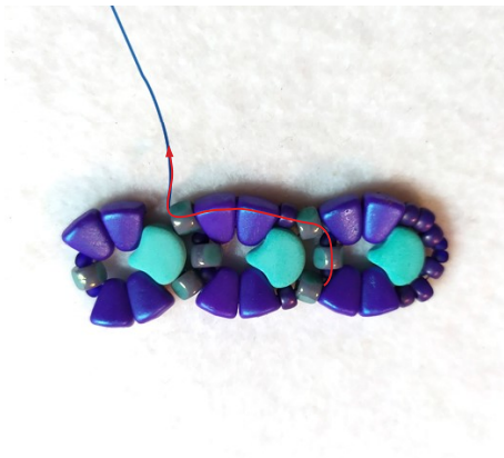
16) Pass through the beads as shown.