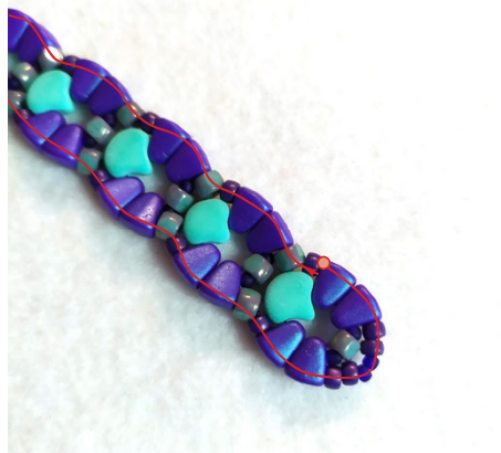
20) Weave whole bracelet around. Finish with a knot and stitch.