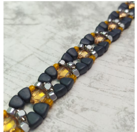
Nib-Bit: 23980/84400 Ginko: 00030/27102 3CUT 6/0: 00030/27000 Matubo 8/0: 81250 Toho 11/0: TR-11-31