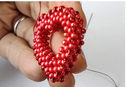
Step 18: Sew the internal part of the heart in the same way, but using size 13/0 seed beads. Change the needle for a size 12 as needed.