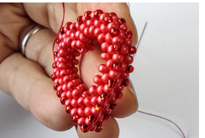
Step 18: Sew the internal part of the heart in the same way, but using size 13/0 seed beads. Change the needle for a size 12 as needed.