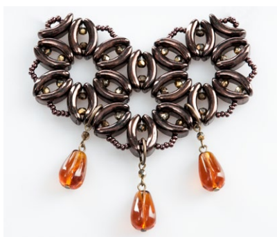
Step 6: Cut off 20 cm of chain and 28 cm with play for adjustment. Use 2x 8mm rings to affix the outer link to the sewn section. Connect a carabiner to the shorter chain at the opposite end using a 5 mm ring. Link 1x PB to the other end of the longer chain.