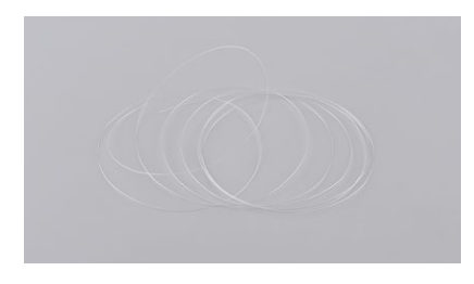
Step 2: String one seed bead. Move it to the middle of the line. Secure it by tying two knots.