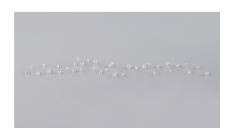
Step 5: Decorate the item of your choice. Use the free ends to firmly attach the decoration.

You can adjust the length of the tied line as required.