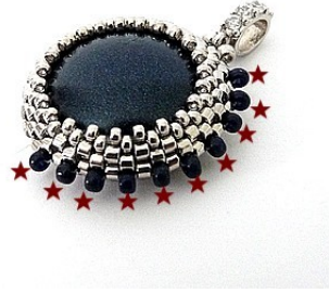
8) Repeat step 7 for the next 10 DB