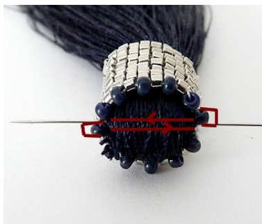
16) Thread through the tassel from each opposite R11 and repeat to strengthen to maintain the tassel