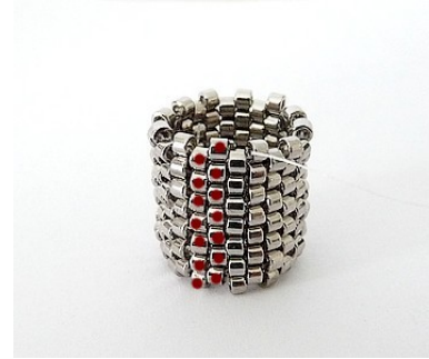
12) Bead 14 Peyote rows