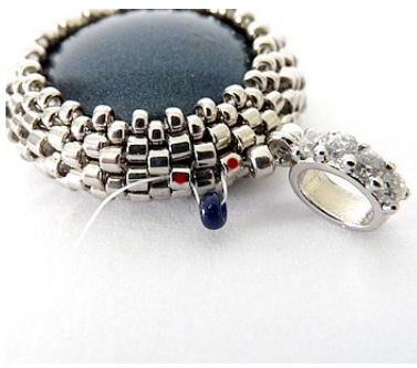
7) Pick up 1 R11, exit through the next DB