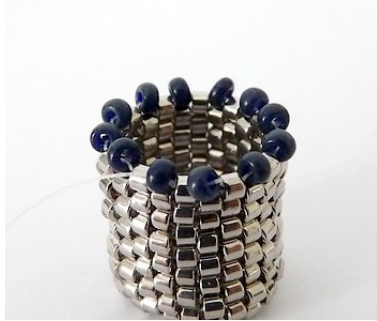
13) Bead 1 R11 row