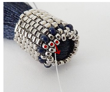
18) Bead 3 R15 rows