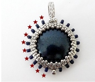
10) Pick up 10 R11 like step 8. Repeat to strengthen and tie off