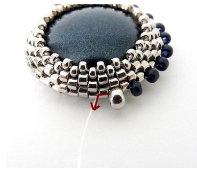
9) Pick up 1 R8