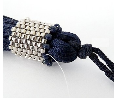
14) Place your tassel