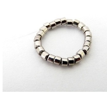
11) For the tassel ☺ Pick up 24 DB and close