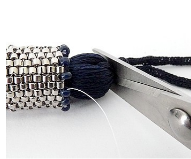
15) Cut the rope