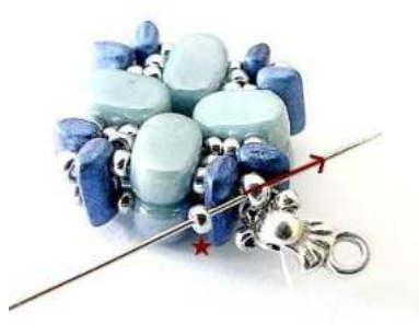
18) Pick up 1 SB15 through the SB11 HERE