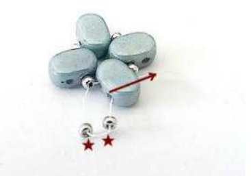
3) Pick up 2 SB15 through the second hole of Lipsi.All the way around <sup>(C)</sup>