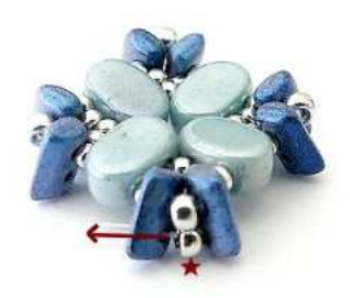
9) Pick up 1 SB11