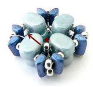
13) Pick up 1 SB11 between each Lipsi and reinforce