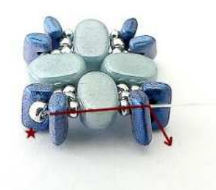
7) Pick up 1 SB11 between the Piros and exit HERE. All the way around 🙄