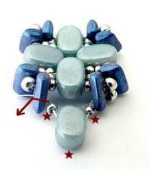
10) Pick up 1 SB15,1 Lipsi and 1 SB15through the next Piros