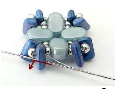
8) Here is the result 😊 Exit through the second hole of Piros HERE