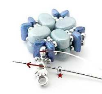
17) Pick up 1 SB15 through the Cymbal