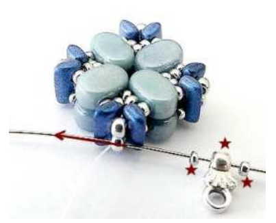
15) Turn the work over. Pick up 1 SB15, 1 Cymbal and 1 SB15 through the same SB11