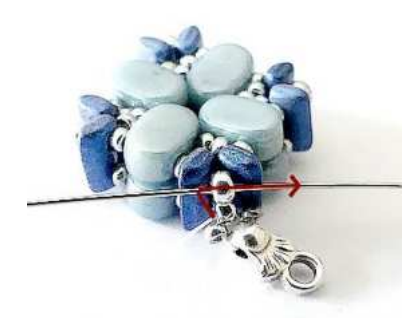
16) Exit through the opposite SB11