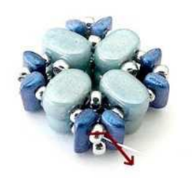
14) Here is the result 😇 Exit through the SB11 HERE