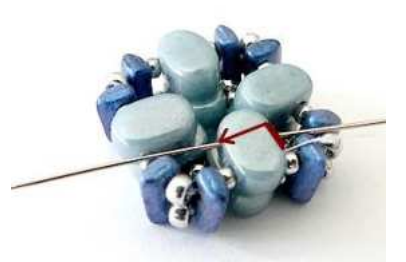
12) Here is the result 😇 Exit through the second hole of Lipsi HERE