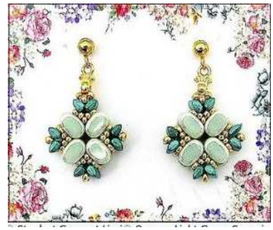
21) Another color

I wish you a happy beading. I offer you this pattern. Please do not change its design and only use Les Perles par Puca<sup>®</sup>- Paris If you publish or share this pattern, thank you for not forgandting to notify that it is Puca<sup>®</sup> who created it.