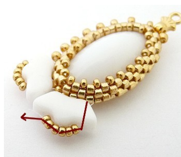
17) Pass through Delos again and through the 6 R15