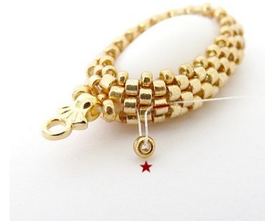
12) Pick up 1 R11 between the DB 11