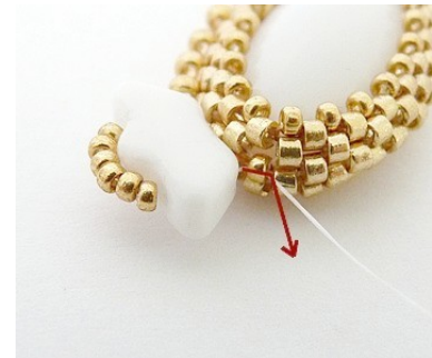
15) Exit through R15 like picture