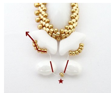
18) Pick up 1 Samos, 1 R15, 1 Samos and exit like picture