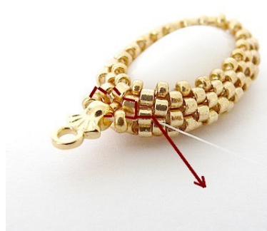
11) Repeat to strengthen and exit like picture