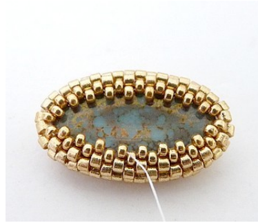
8) Bead a second row of R15, tighten