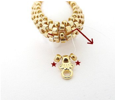
10) Pick up 1 R11, 1 Cymbal, 1 R11. Exit like picture