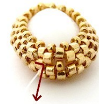
9) Exit like picture