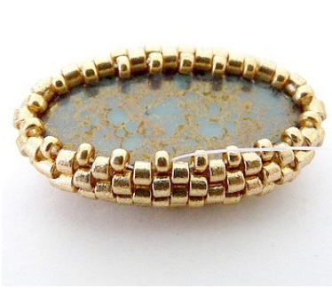
7) Bead a row of R15