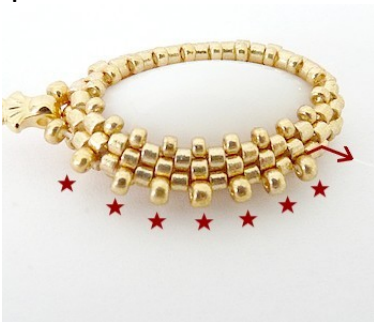
13) Pick up a total of 7 R11