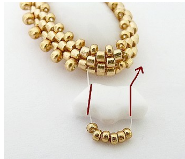
14) Pick up 1 Delos, 6 R15, exit through Delos