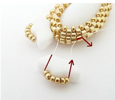
16) Pick up 1 Delos, 6 R15 exit through Delos and DB11