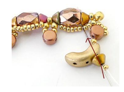
18) Pass through same Konos and Arcos