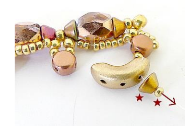
17) Pick up 1 Konos, 1 R15