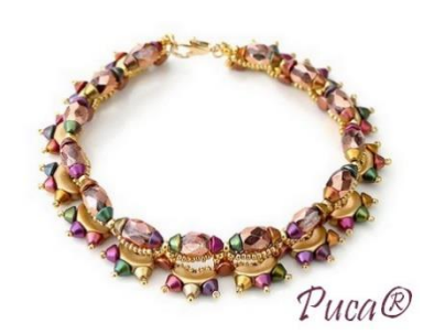
29) Congratulations, you have finished your bracelet!

Happy beading! Thank you for respecting my work ©