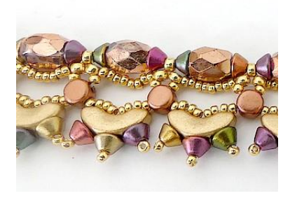
27) You can close your work