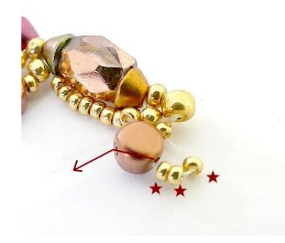
15) Pick up 3 R15, pass Kalos, 1 R15, pass through through 2nd hole of Kalos