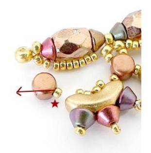
21) At the end of the bracelet, pick up 1 R15, 1 Kalos