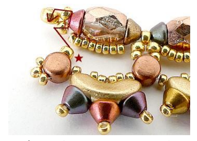
23) Pick up 1 R11 and pass through 2 R11 and R8 like picture