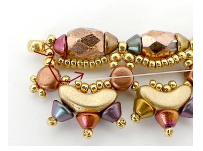
24) Pass through 2R11, Kalos and R15