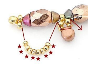
11) Pick up 8 R15 and pass through beads like picture. Repeat for the length of the pattern