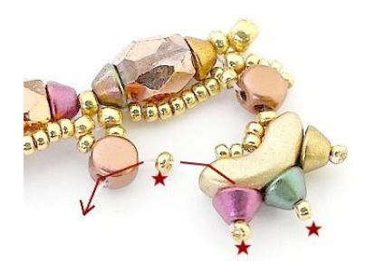
20) Pick up 1 R15, pass through 2nd hole of Kalos, repeat steps 16 to 20 for the length of the pattern