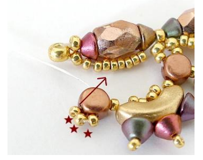
22) Pick up 3 R15, pass through 2nd hole of Kalos