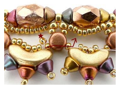
26) Pick up 1 R15, pass through R15, Kalos, R15. Repeat steps 25 and 26 for the length of the pattern