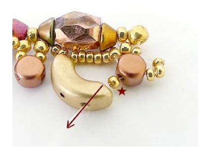
16) Pick up 1 R15, 1 Arcos