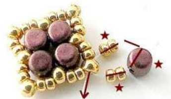
6) Insert 2 SB15, 1 Minos and 2 SB15 through the same SB11.