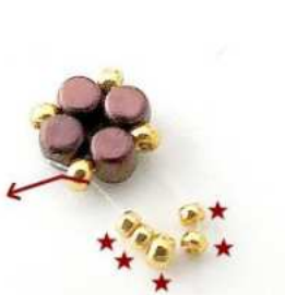
4) Insert 2 SB15, 1 SB11 and 2 SB15 between each SB11.