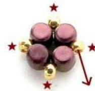
3) Insert 1 SB11 between each Minos. Exit HERE