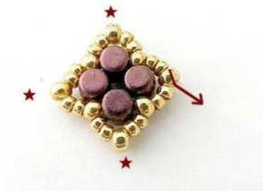
5) Here is the result 😊 Exit through SB11 HERE