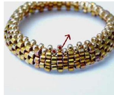
3) Make another 2 rows with SB15.