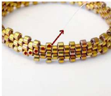
2) With DB11 and using peyote technique, make 5 rows in all.