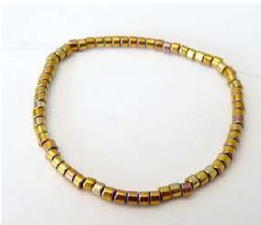
1) String 66 DB11 and tie the beads in a circle.