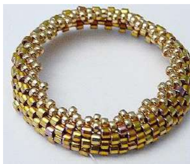
5) You will have this.