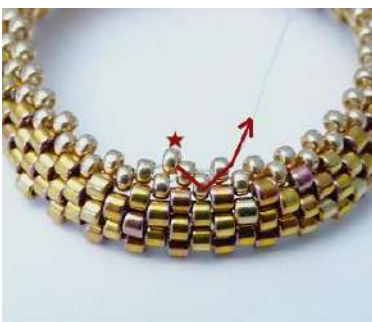
4) Make another row with SB15 by jumping one of two SB15.