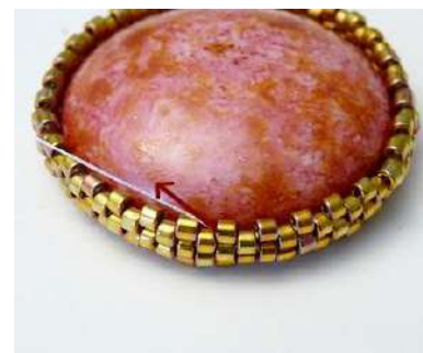
6) Turn your work, add the cabochon and go out through DB11.