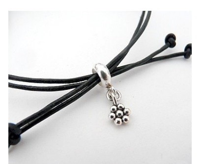
8) Place a charm on the stop bead if you wish 3

Happy beading! Thank you for respecting my work ©©