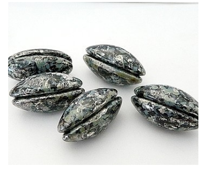
Glue your Athos one over the other and leave 12 hours