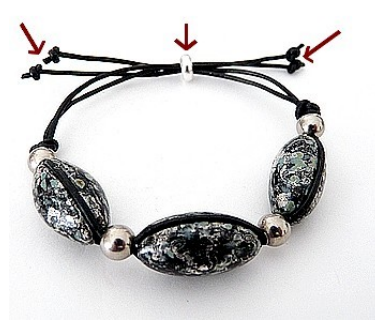
7) Place a stop bead like picture, tie a knot on each ends of the 4 cords