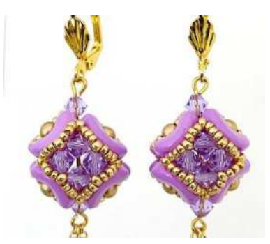
20) The earrings Arcade 4 are finished © Congratulations ©

I wish you a happy beading. I offer you this pattern. Please do not change its design and only use Les Perles par Puca®- Paris If you publish or share this pattern, thank you for not forgandting to notify that it is Puca® who created it.