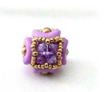
13) You have finished your pearl Arcade 4 😊