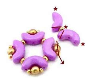
4) Pick up 1 Arcos, 1 SB11 and 1 Arcos HERE in the three beads