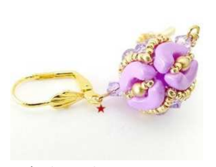
19) Place the ear wires Do the second earring