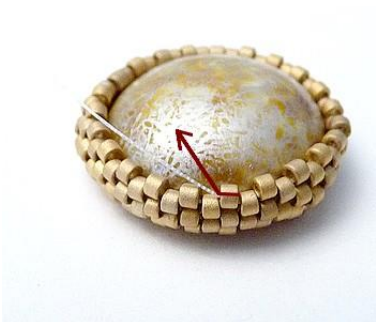
4) Turn your work, add the cabochon and go out through DB11.