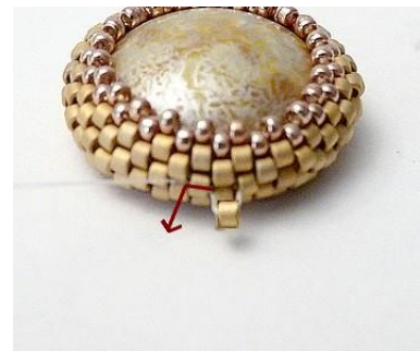
6) Add 1 DB 11.