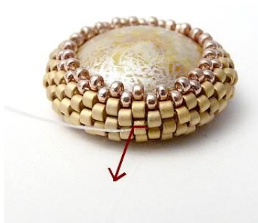
5) Make 2 rows with SB15. Pass through the beads and go out through DB11 (3 rd row)