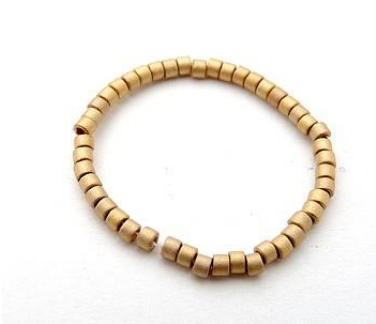
1) String 46 DB11 and tie the beads in a circle.