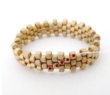
2) With DB11 and using peyote technique, make 5 rows in all.