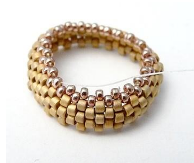
3) Make another 2 rows with SB15.