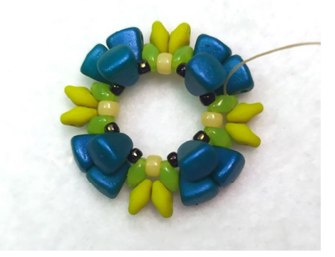
6) Steps 4) and 5) repeat three times.