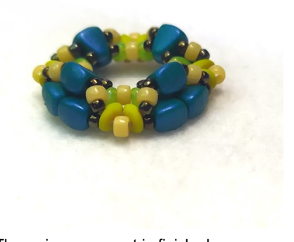
15) The main component is finished.