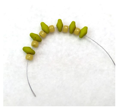
16) Tassel: string 1x M8/0 and 1x SD. Repeat five times.