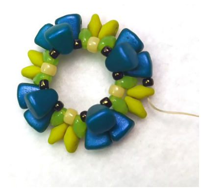
8) Add 1x T11/0 and go through the free hole of the next SD.