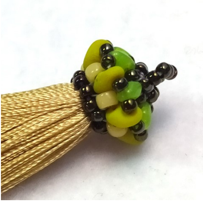
31) Step 30 repeat five times. Tie together firmly and finish with a knot and stitch.