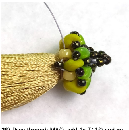
28) Pass through M8/0, add 1x T11/0 and go through the next M8/0.