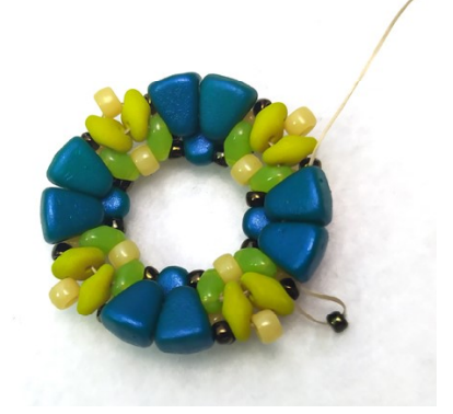
13) Turn the component around and string 1x T11/0 and go through the free holes of the next two NB (wide end).