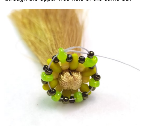
22) Add 1x T11/0 between each MD. Go through the first added T11/0 again.