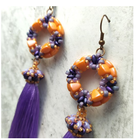
Nib-Bit: 02010/24507 Superduo: 23980/79021 Miniduo: 21310/14400 Matubo 8/0: 03000/85001 Toho 11/0: TR-11-2112