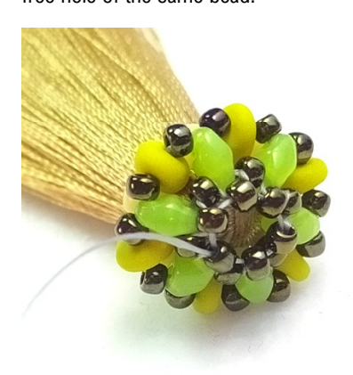
24) Between each T11/0 added in step 22) add one T11/0 and tighten.