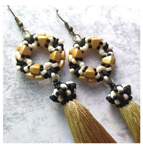
Nib-Bit: 02010/24506 Superduo: 02010/29531 Miniduo: 03000/14413 Matubo 8/0: 03000/14413 Toho 11/0: TR-11-49F