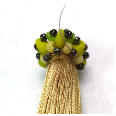
29) Step 28) repeat five times.