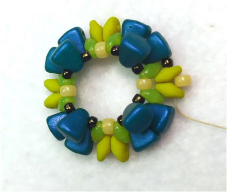
9) Add 1x M8/0 and go through the free hole of the next SD.