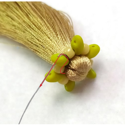
19) Go through M8/0 and SD and pass through the upper free hole of the same SD.