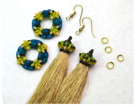
32) Material for creating an earrings. Attach earwire and earrings with jump rings. Thread the jump rings into the M8/0 beads on the outer edge of the component (on the opposite sides).