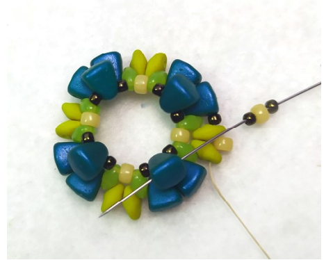
10) String 1x T11/0, 1x M8/0 and 1x T11/0 and go through the free hole (wide end) of NB (in the top row).