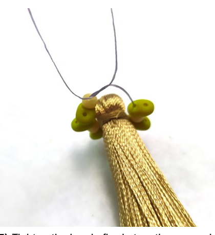
17) Tighten the beads firmly together around the tassel.