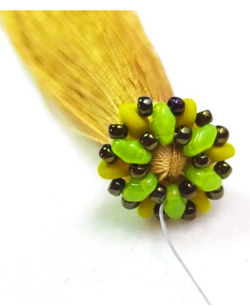
23) Tighten the beads to closing the top of the tassel.