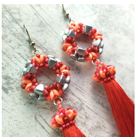
Nib-Bit: 00030/01700 Superduo: 02010/29577 Miniduo: 91250/84110 Matubo 8/0: 90080/85106 Toho 11/0: TR-11-979