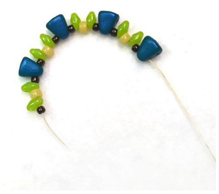
1) String 1x T11/0, 1x MD, 1x M8/0, 1x MD, 1x T11/0 and 1x NB (narrow end). Repeat three times.