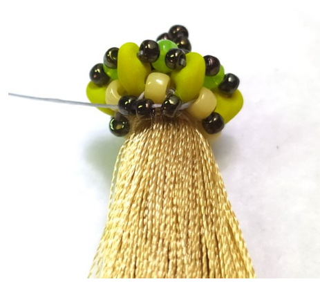
30) Add T11/0 between two T11/0 in the previous row.