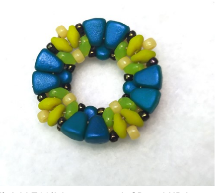
14) Add T11/0 between each SD and NB in this row. Finish with a knot and stitch.