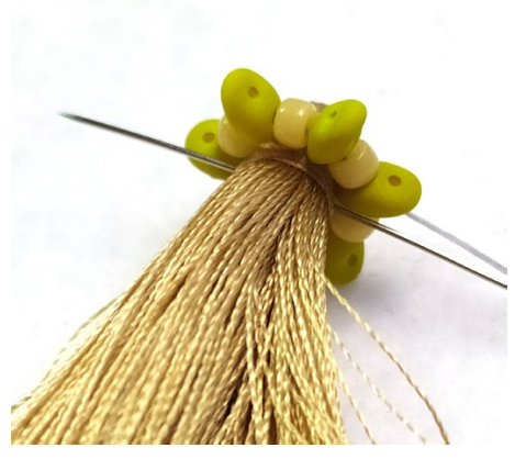
18) Stitch several times through the tassel. This will fix the position of the beads.