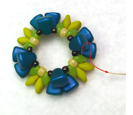
7) Go through the next NB and go back through the free hole (wide end) of this bead.