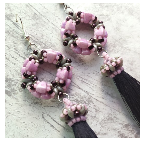
Nib-Bit: 03000/14494 Superduo: 03000/14449 Miniduo: 23980/81002 Matubo 8/0: 23980/15726 Toho 11/0: TR-11-145F