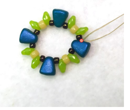
2) Tie the beads together with a double knot.