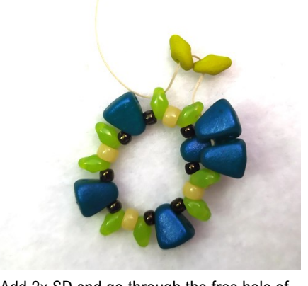
5) Add 2x SD and go through the free hole of the next MD.