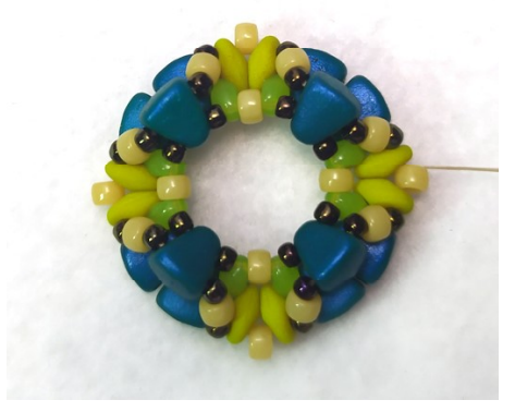
12) Steps 10) and 11) repeat three times.