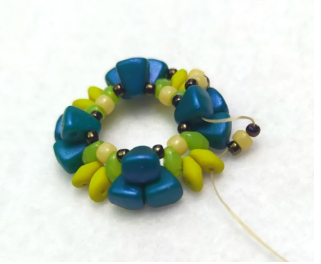
11) String 1x T11/0, 1x M8/0 and 1x T11/0 and go through the free hole of the next SD (in the bottom row).