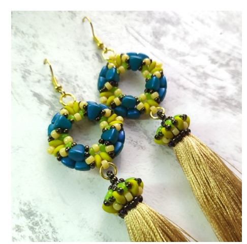
Nib-Bit: 02010/24514 Superduo: 02010/29535 Miniduo: 51010 Matubo 8/0: 13020 Toho 11/0: TR-11-83