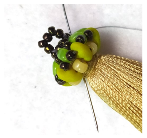
27) Stitch through the tassel to the bottom of the component.