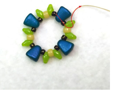
3) Pass through NB, T11/0 and MD and go back through upper free hole of the same bead.