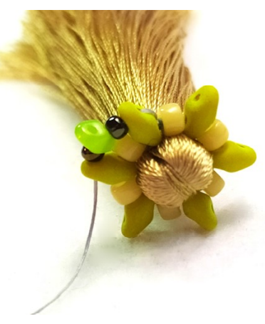
20) String 1x T11/0, 1x MD and 1x T11/0 and go through the upper free hole of the next SD.