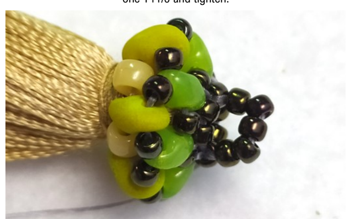
26) Pass through the loop again.