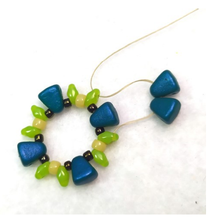
4) Add 2x NB (narrow end) and go through the free hole of the next MD.