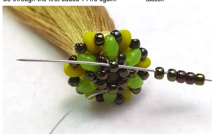
25) String 5x T11/0 and go through T11/0 on the opposite side of the circle and create a loop.