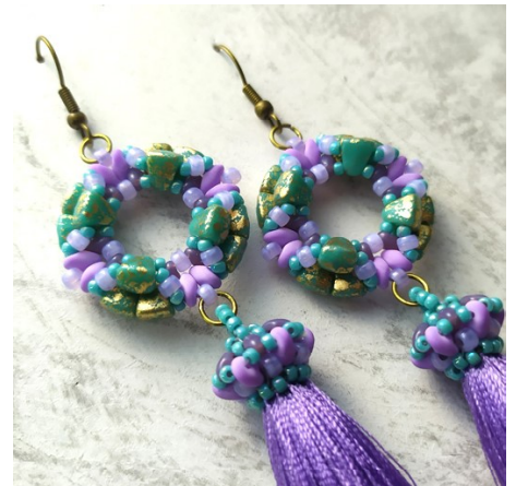
Nib-Bit: 63130/94401 Superduo: 02010/92945 Miniduo: 21010 Matubo 8/0: 21310 Toho 11/0: TR-11-413