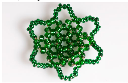
Levels 7 & 8 Use the entire Level 5 as a base. Add new loops to the tops of the existing loops with R 10 (Level 7-14 pcs, Level 8-18 pcs), (fig. no. 4).

existing loops with R 10 (Level 5- 10 pcs, Level 6- 14 pcs), (fig. no. 3).