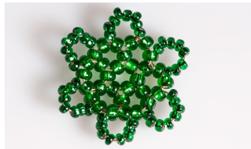
Levels 5 & 6 Use the same steps as Level 3 and 4, and again add an additionalsix loops, each made of 4 \times \mathbf{R}8 . Add new loops to the tops of the

existing loops with R 10 (Level 5- 10 pcs, Level 6- 14 pcs), (fig. no. 3).