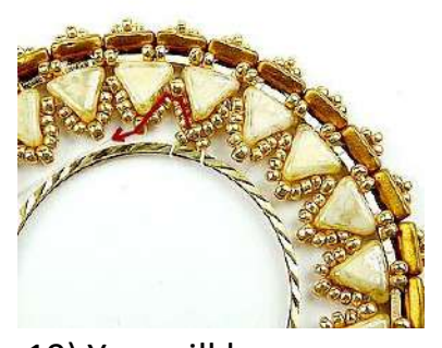
19) You will have this. Pass through the beads and go out through the SB11 (under the next Kheops). Repeat step 15 to step 19 around the circle.