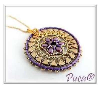
35) Another color ...