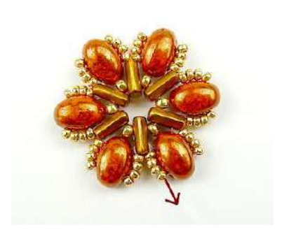
26) You will have this. Go out through SB15 (before Samos).