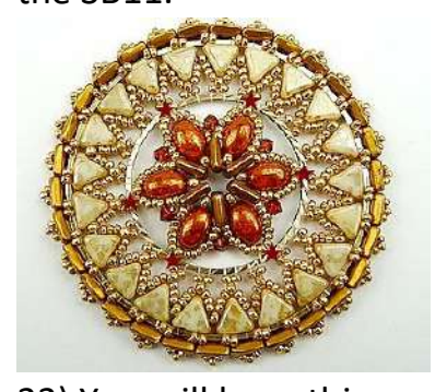
33) You will have this.