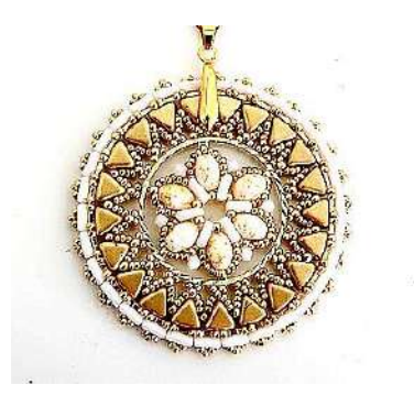
36) ... and another color

Happy beading! Thank you for respecting my work.