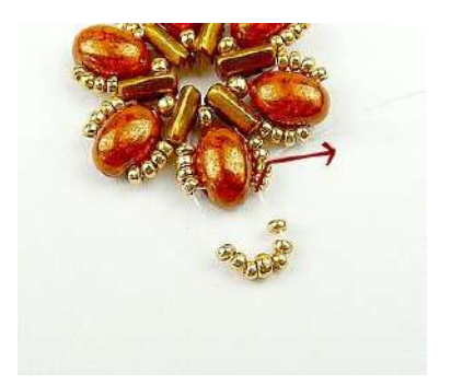
27) String 3 SB15, 1 SB11, 3 SB15, go around Samos and pass through the next 2 SB15.