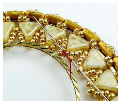
18) Pass over the circle, then through the last SB15 added and through the SB11.