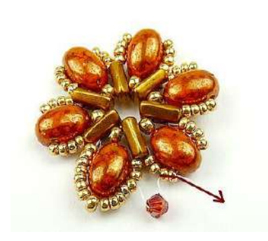
28) String 1 B3 and pass through the 2 SB15 before next Samos.