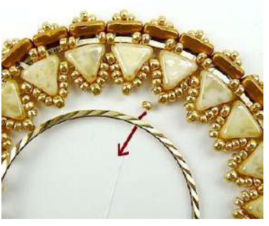
15) String 1 SB15 and pass under the 30 mm circle.