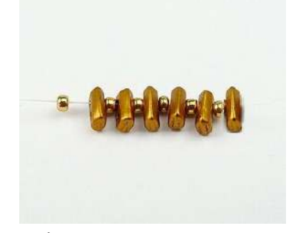
21) Now we will work at the center of the circle. On a new Fireline thread alternately string 6 Piros and 6 SB11.