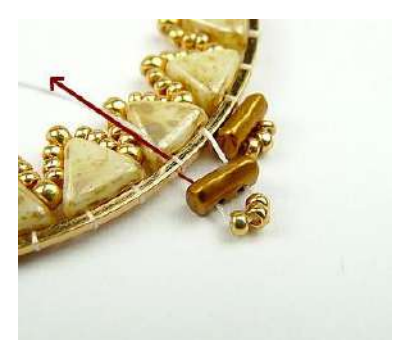
11) String 1 Piros, 3 SB15, pass through the 2<sup>nd</sup> hole of Piros, then under the circle. Repeat step 11 around the circle.