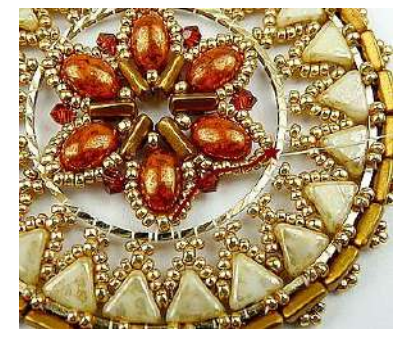
32) Pass through the beads until you reach the next SB11 (in top of Samos). Repeat steps 30 and 31 around the circle.