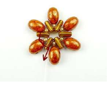
24) You will have this.