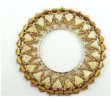
20) You will have this.