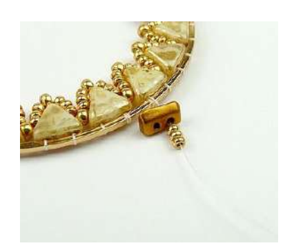
9) String 1 Piros and 3 SB15.