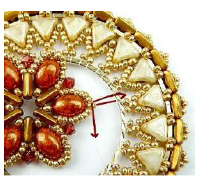
30) Now we will attach this pattern to the circle. Pass under the circle, then pass again through the SB11.