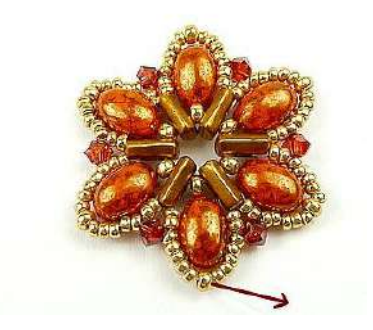
29) Repeat steps 27 and 28 for each Samos and go out through the SB11.