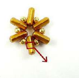
22) Tie the beads in a circle, then pass through the 2<sup>nd</sup> hole of Piros.