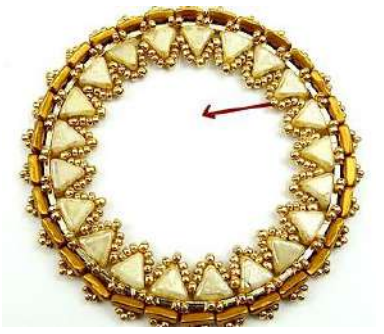
14) You will have this. Go out through the SB11.