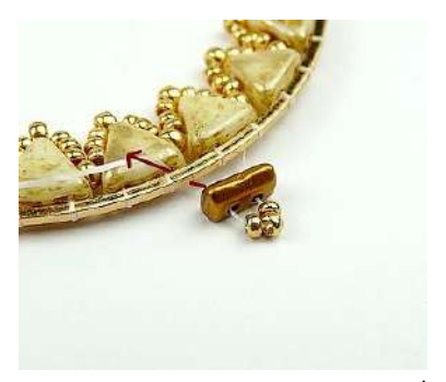
10) Pass through the 2<sup>nd</sup> hole of Piros, then under the circle.