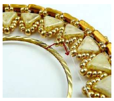
16) Pass over the circle, then through the SB15 (near to the SB11) and through the SB11.