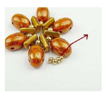
25) String 4 SB15 and pass through the 2<sup>nd</sup> hole of Samos. String 4 SB15 and pass through the next Piros. Repeat this step for each Samos.