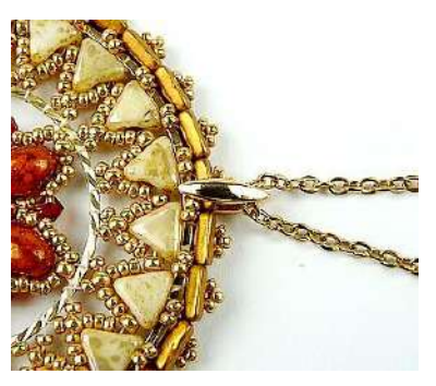
34) Place the pinch bail and the chain. Congratulations, you have finished the Pilar pendant!