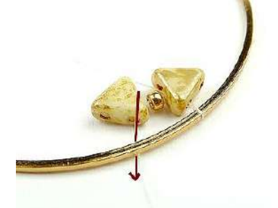
3) String 1 RSB11, 1 Kheops and go down under the circle.