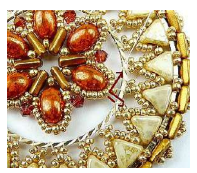
31) Repeat step 30 in the same SB11, changing the direction of the passage through the SB11.