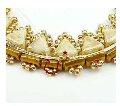
13) String 2 SB15, pass through the next Piros, then to the 3 SB150, the 2<sup>nd</sup> hole of the Piros and go out between Piros and the circle. Repeat this step around the circle.