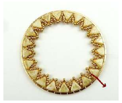
8) You will have this. Go out through Kheops.