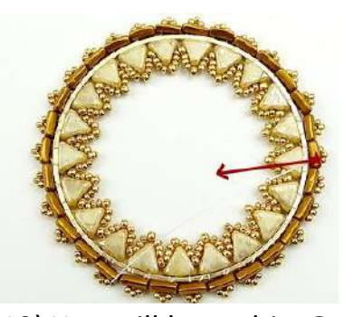
12) You will have this. Go out through Piros (between Piros and circle).