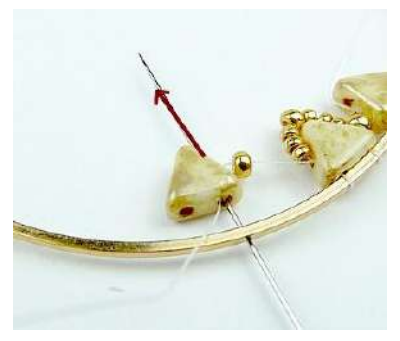
7) String 1 RSB11 and 1 Kheops, then repeat step 3 to step 6 around the circle (inside).