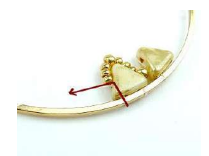
6) Pass over the circle then through the Kheops.