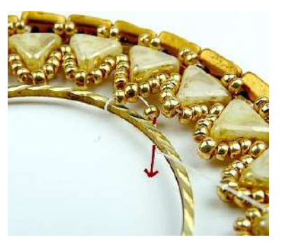
17) String 1 SB15 and pass under the circle.