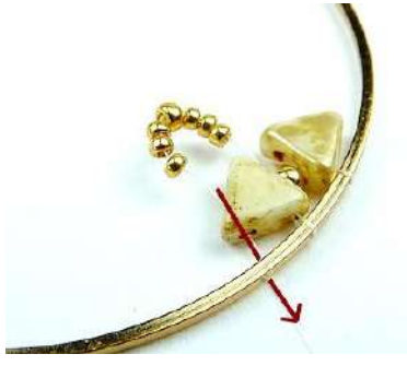
5) String 3 SB15, 1 SB11, 3 SB15, pass through the 2<sup>nd</sup> hole of the Kheops then under the circle.