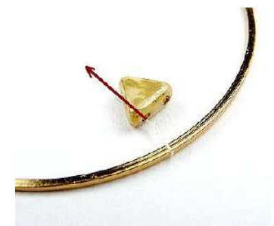
2) String 1 Kheops.