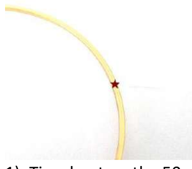
1) Tie a knot on the 50 mm circle.