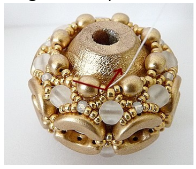
20) You'll now have this ② Exit like picture through R15