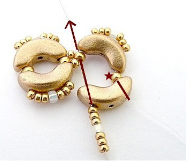
7) Pick up 1 Gold R11, 1 Arcos, 3 R15, 1 R11, 3 R15, pass through Arcos and exit through R11