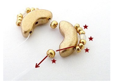
3) Pick up 3 R15, 1 R11, 3 R15 pass through Arcos, add 1 gold R11