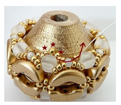
17) Pick up 1 R15, 1 R11, 1 R15 and exit like picture. Repeat for the length of the pattern