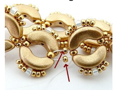
10) Pick up 1 R15, pass through R11 of your first element, add 1 R15 and exit through the R11