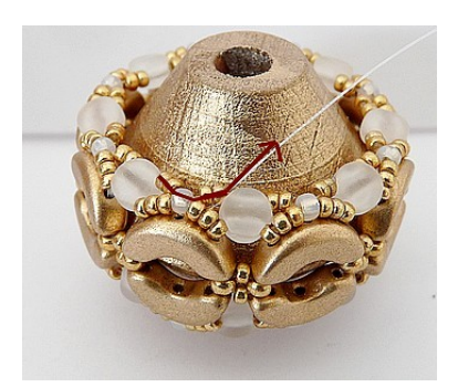
16) You'll now have this Exit like picture through the 2 R15