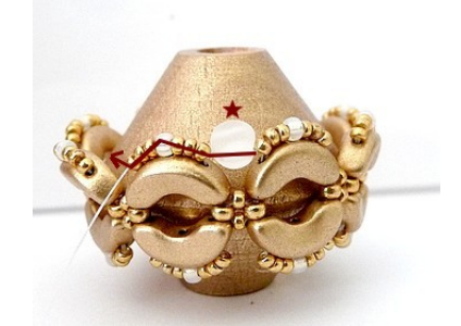
12) Pick up 1 Kalos between each set of seed beads. Repeat for the length of the pattern