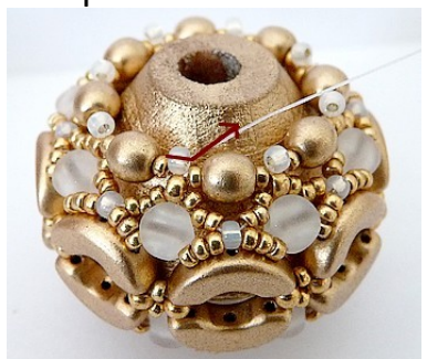
22) You'll now have this Exit through R11