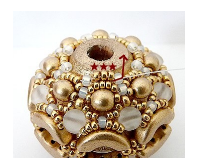
27) Between each R11, pick up 3 R15. Repeat for the length of the pattern