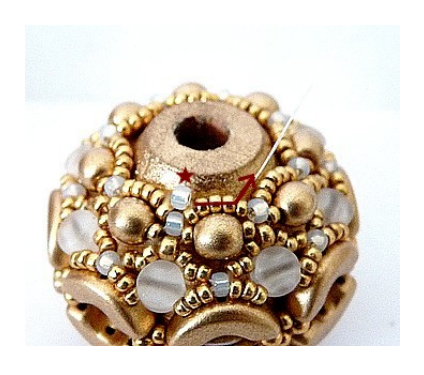
25) Between each R15, pick up 1 R11. Repeat for the length of the pattern