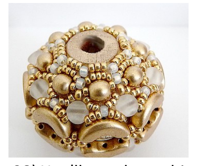
28) You'll now have this We're going to bead the second part