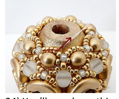
24) You'll now have this Exit through 4th R15