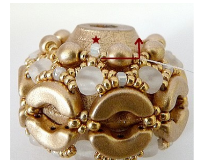
21) Between each R15, pick up 1 R11 and exit like picture. Repeat for the length of the pattern