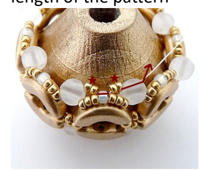
15) Pick up 2 R15, pass through R11, add 2 R15 exit through Kalos. Repeat for the length of the pattern