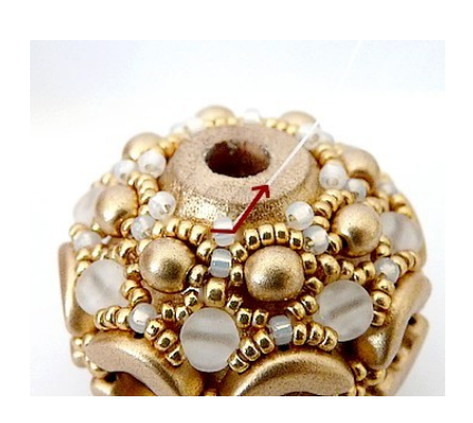
26) You'll now have this Exit like picture through R11