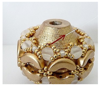
18) You'll now have this Exit through central R11