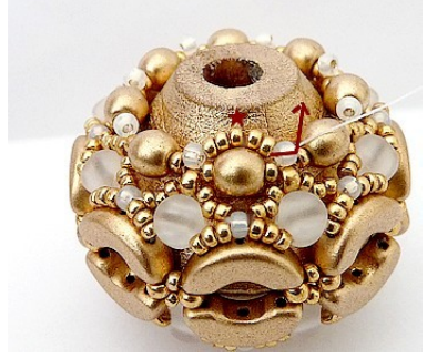
23) Between each R11, pick up 5 R15. Repeat for the length of the pattern