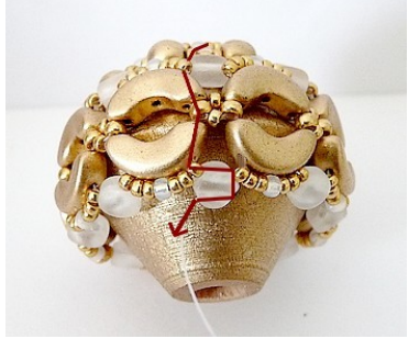
29) Exit like picture through Kalos. And repeat steps 15 to 27