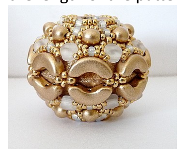
30) You'll now have this (3) You can close your work