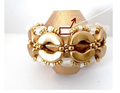
14) Repeat step 12 for the length of the pattern and exit through top hole of Kalos