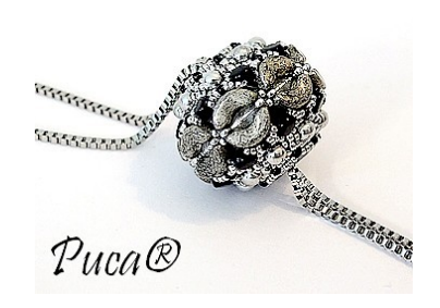
The « Kalo » beaded bead can be used as a long necklace, a bag charm, etc...

Happy beading! Thank you for respecting my work ©