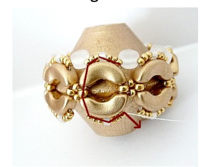
13) You'll now have this Exit like picture through the 7 seed beads