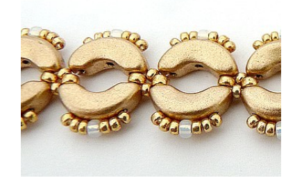
9) Repeat steps 5 to 8 for the length of the pattern until you have used a total of 16 Arcos