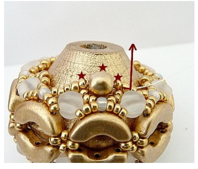
19) Between each R11, pick up 1 R15, 1 PR4, 1 R15, exit through R11. Repeat for the length of the pattern