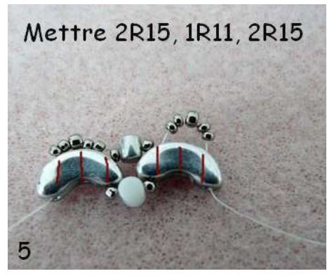
5) Pick up 2 SB15, 1 SB11 et 2 SB15. Pass through Arcos® (2<sup>nd</sup> hole).