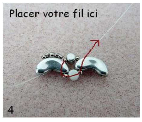
4) Pass again through the SB15, Minos®A, SB15 and Arcos®.