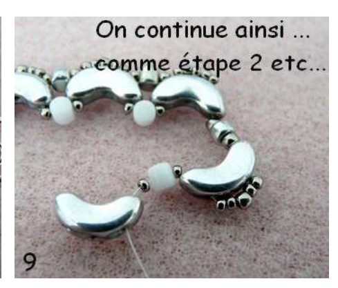
9) Repeat steps 2 - 8.