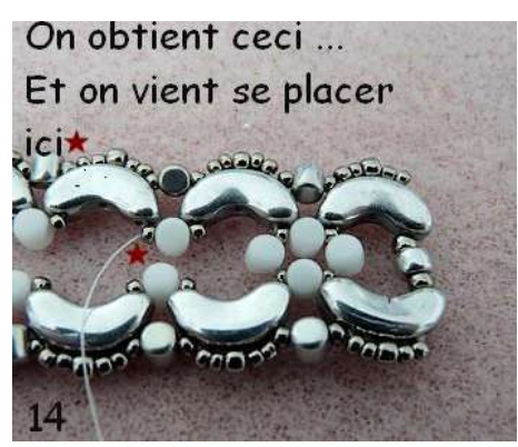
14) We will have this. Pass through the beads and go out through the SB15 (red star).