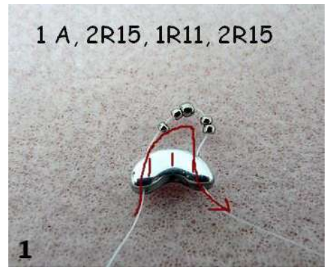
1) Pick up 1 Arcos®, 2 SB15, 1 SB11, 2 SB15. Pass through Arcos® (2<sup>nd</sup> hole).