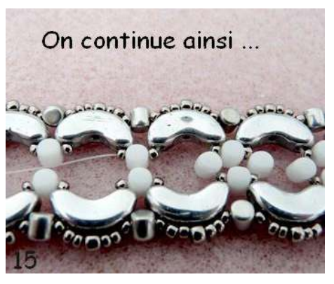
15) We will continue in the same way.