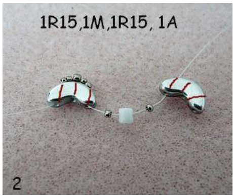
2) Pick up 1 SB15, 1 Minos®A, 1 SB15 and 1 Arcos®.