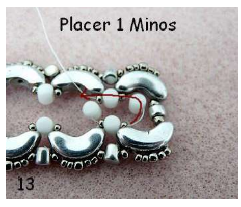
13) Repeat step 12.