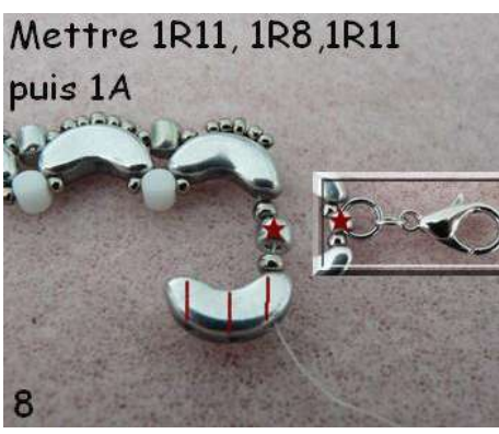
8) Pick up 1 SB11, 1 SB8, 1 SB11 and 1 Arcos®.