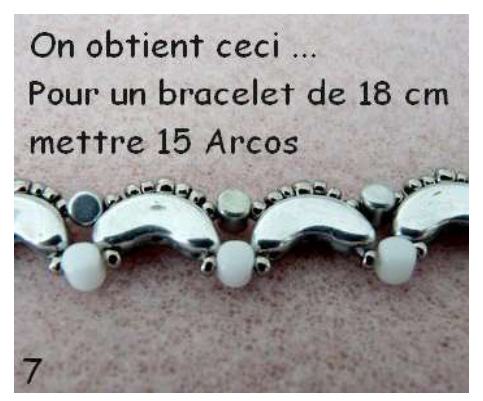
7) We will have this. For a 18 cm bracelet, put 15 Arcos®.