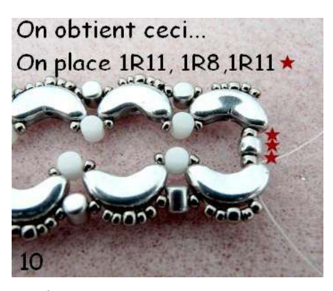
10) We will have this. Pick up 1 SB11, 1 SB8 and 1 SB11.