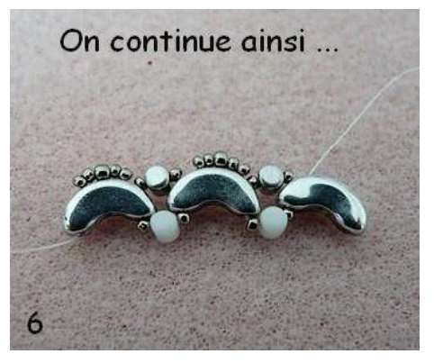
6) We will continue in the same way.