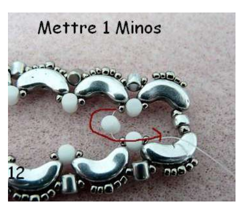
12) Add 1 Minos®A and pass through SB15, next Minos®A and SB15.