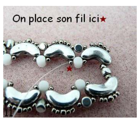
11) Pass through the beads and go out through the Minos®A (red star).