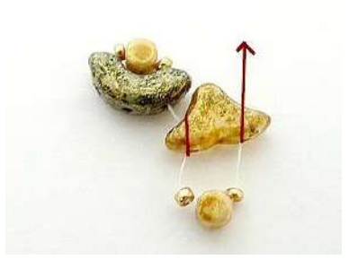
2) String 1 Helios, 1 SB15, 3) Repeat step 1. 1 Minos, 1 SB15 and pass through Helios (2<sup>nd</sup> hole).