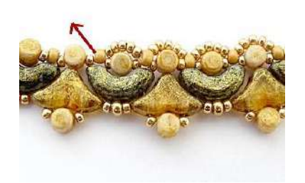
16) Repeat step 15 until the end of the row.