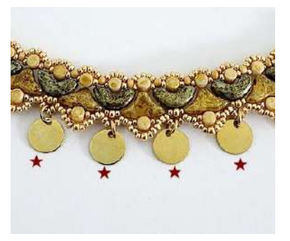
24) Add the charms using jump rings.