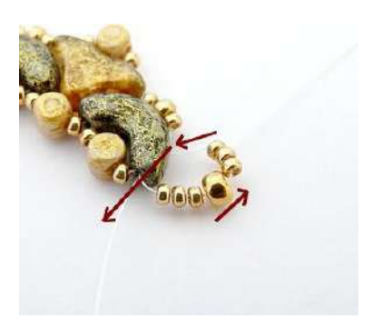
9) String 3 SB15, 1 SB8, 3 SB15 and pass again through Arcos to make a loop. Go again through the last beads added to strengthen the work.