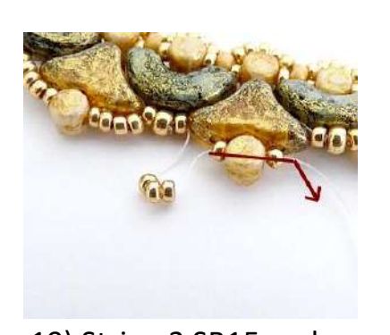
19) String 3 SB15 and pas through the group of SB15, Minos, SB15. Repeat steps 18 and 19 until the end of the row.