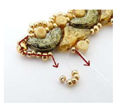
17) Go out through SB15 (after SB11). String 5 SB15 and pass through the SB15 (before Minos).