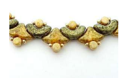
4) Repeat alternating steps 1 and 2 until you have added all 14 Arcos.