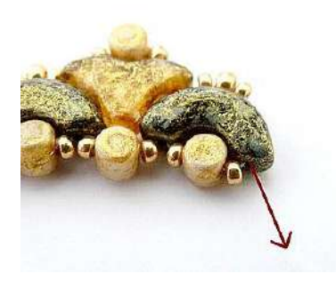
8) Go out through last Arcos.