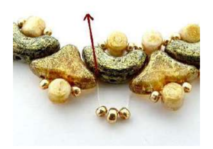
7) String 1 SB15, 1 SB11, 1 SB15 and pass through the same Arcos (3rd hole). Repeat steps 6 and 7 until the end of the row.