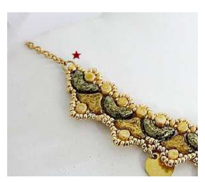
25) Now add the chain and the clasp. You have finished the necklace.

Happy Beading! Thank you for respecting my work.