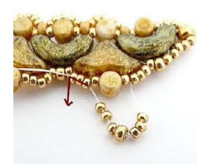
21) String 3 SB15, 1 SB11, 3 SB15 and pass through the group of 3 SB15.