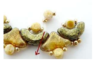
6) String 1 SB15, 1 Minos, 1 SB15 and pass through the next Arcos.