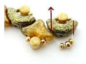
5) Go out through Arcos. String 1 SB15, 1 SB11, 1 SB15 and pass through the same Arcos (3rd hole).