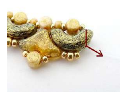
13) Go out through Arcos.