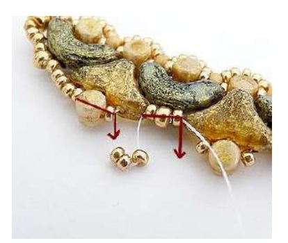
18) Pass through Minos and SB15. String 3 SB15 and pass through the group of SB15, SB11, SB15.