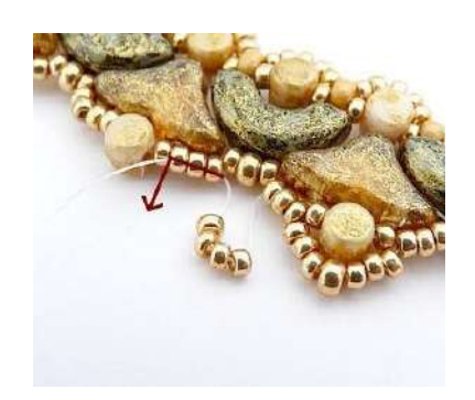
22) String 4 SB15 and pass through the next group of 3 SB15. Repeat steps 21 and 22 until the end of the row.