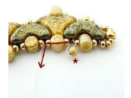
11) String 1 SB11 between each group of 3 beads).