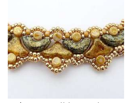
23) You will have this.