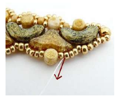
20) Go out through the SB15 (red arrow).