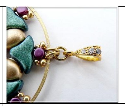
17) Place a new ring into the 2 others and a bail