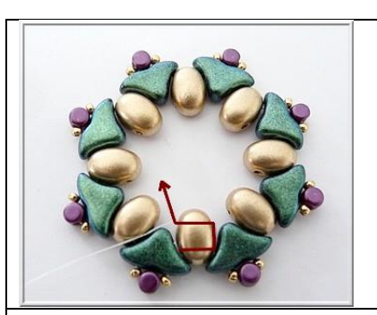
4) You will now have this Exit through Samos