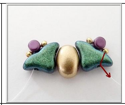
3) Repeat step 1 and thread until you have used a total of 8 Hélios