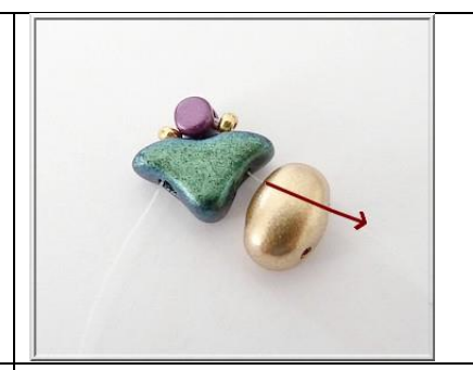
2) Pick up 1 Samos