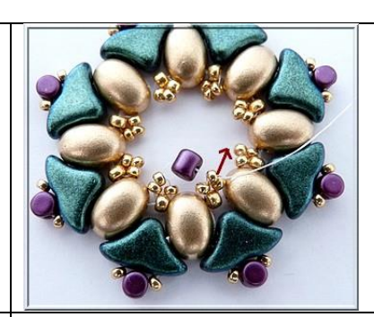
9) Pick up 1 Minos between the central R15