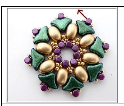
10) You will now have this. Exit through Minos