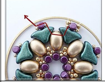
14) You will now have this. Exit through next Minos