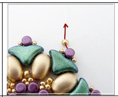
11) Pick up 1 R11