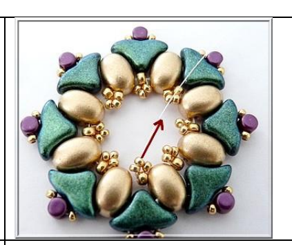
8) You will now have this Exit through the central R15