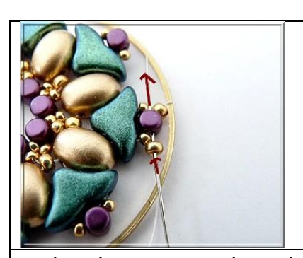
13) Pick up 1 R11, thread under the circle, thread through R11 and Minos