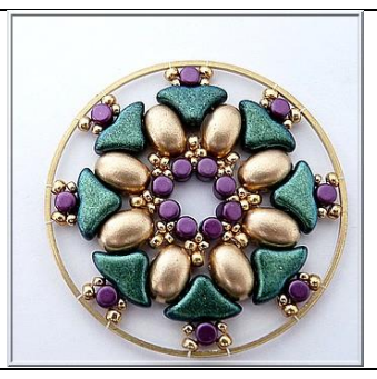
15) Repeat steps 12 to 14 for the length of the pattern and close your work