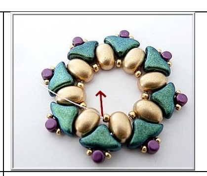
6) You will now have this Exit through R11