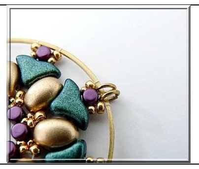
16) Place 2 rings into the circle like picture