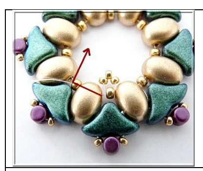
7) Pick up 3 R15, exit through R11, thread through the following R11