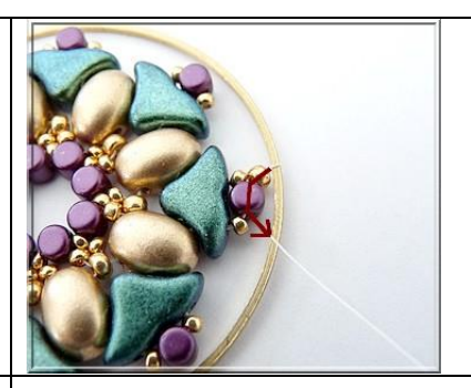
12) Place the circle, thread above the circle, thread through R15 and Minos