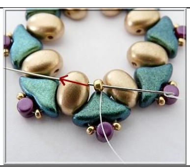
5) Pick up 1 R11 between each Samos